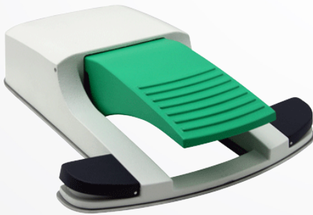
SINGLE LINEAR PEDAL WITH SIDE FLAPPER PEDALS