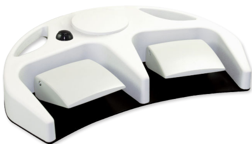
TWIN RF LINEAR WIRELESS