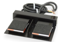
TWIN WITH WIRED CHANNEL