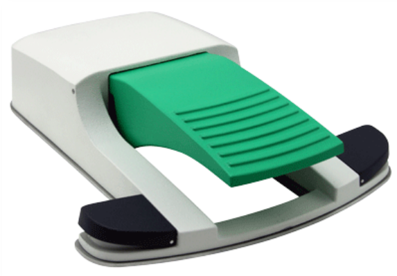
Single Linear Pedal with Side Flapper Pedals