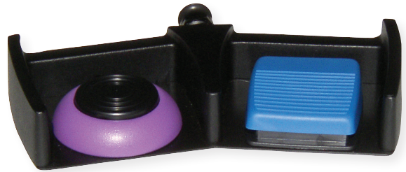
GEM & Aquiline