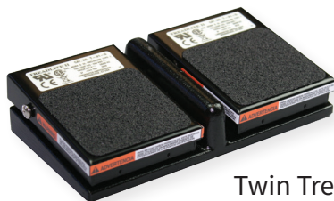
Twin Treadlite II