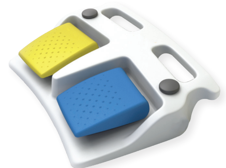
Twin Aero with Flip-up Pedals