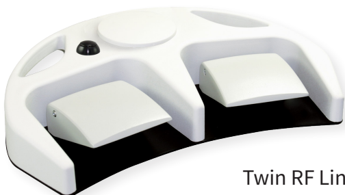
Twin RF Linear Wireless